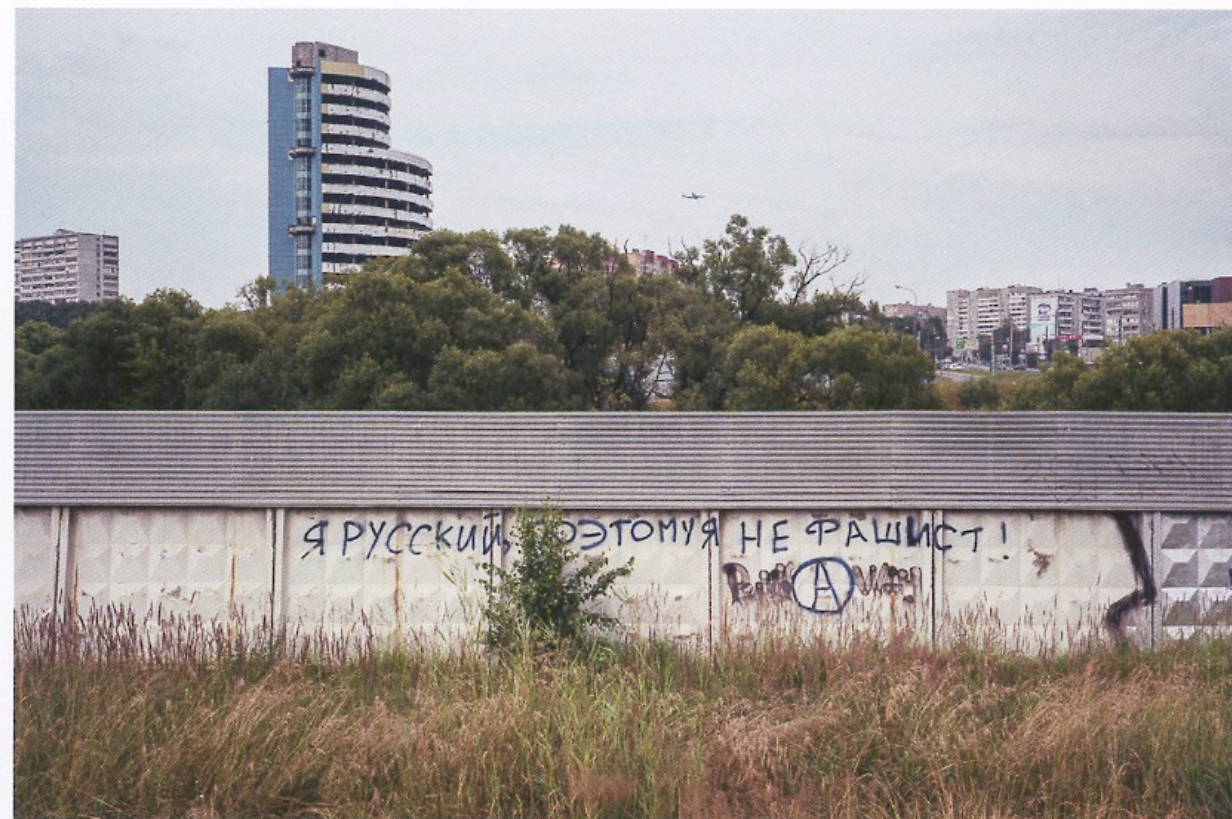
ANDREY IVANOV, fra serien / from the series, 282, Identity index (2013)