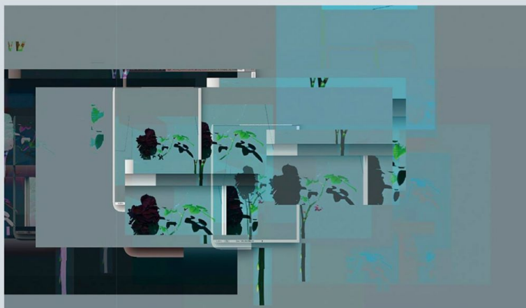
Connections, Phantom series, 2016