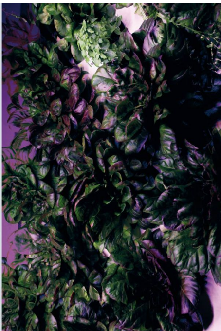
Untitled, Phantom series, 2016